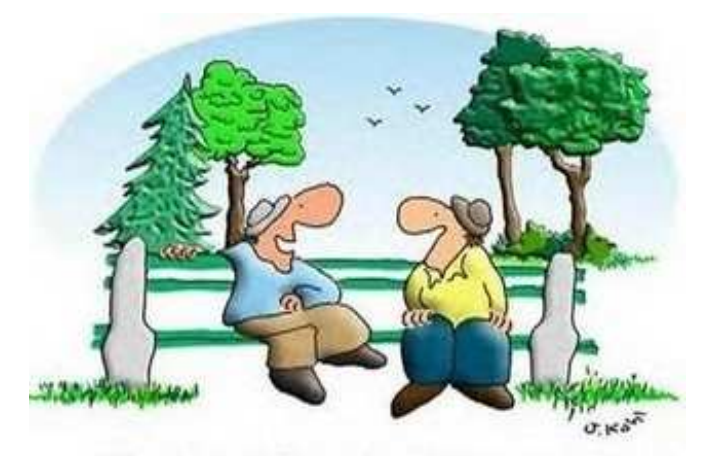
"My doctor told me to avoid any unnecessary stress, so I didn't open his bill."